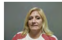
Bossier Booking Mugs Jan 7