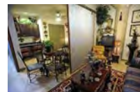
Ogilvie Hardware Lofts